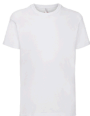
Plain White PE T-Shirt