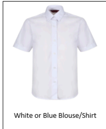
White or Blue Blouse/Shirt