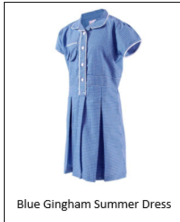
Blue Gingham Summer Dress