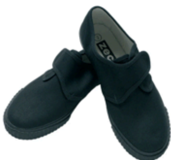
Black Plimsolls or Trainers for PE ONLY