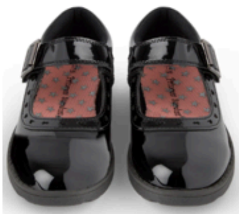
School Shoes Example