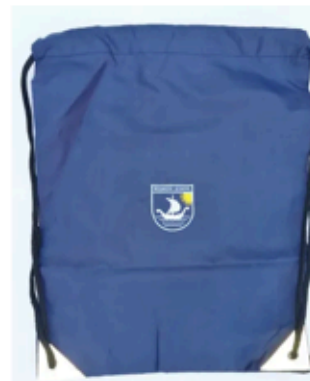
School Logo PE Bag