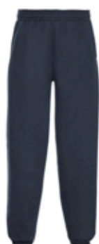
Black or Navy PE Tracksuit Bottoms