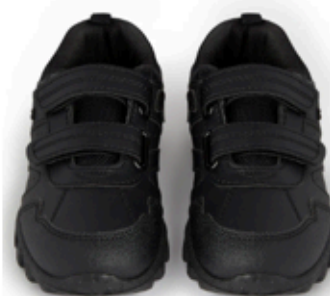
School Shoes Example