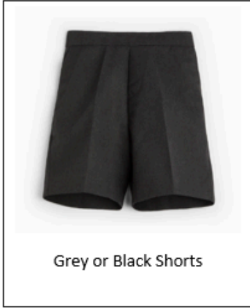
Grey or Black Shorts