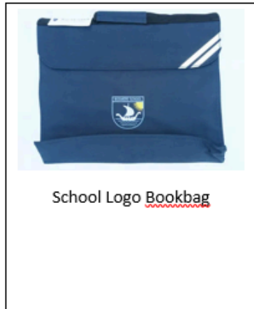
School Logo Bookbag