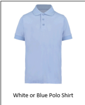
White or Blue Polo Shirt