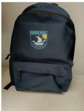
School Logo Rucksack