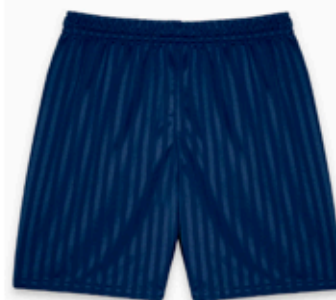
Black or Navy PE Shorts