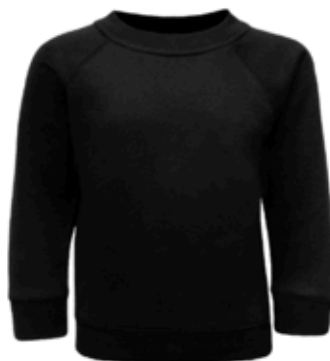
Black or Navy PE sweatshirt